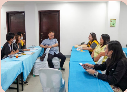
TSU's Records-Archives unit, Tarlaqueño Studies to publish first university historical book