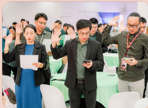
86 faculty members claim promotion via JC 3