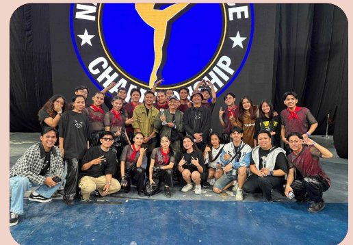
TSU hip hop, contemporary dance teams dominate national stage